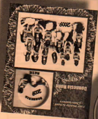
5X7 TEAM PICTURES