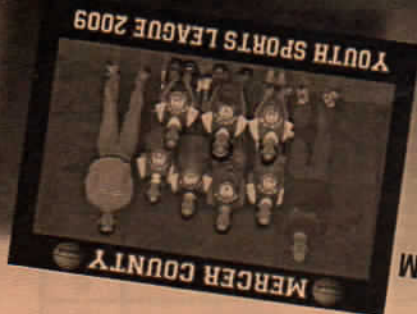
16X20 TEAM POSTER